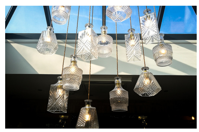
Indoor lights made out of upcycled glass decanters

Building or designing with low or zero Volatile Organic Compounds (VOC) is known to encourage the health of employees and guests. Materials, including paint, carpets, stains, furniture, and insulation, that have low or zero VOC also reduce the emission of smog-forming compounds, thus maintaining and enhancing air quality.