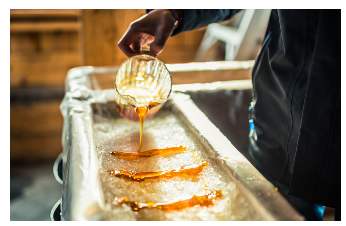
Pouring maple syrup onto snow to make maple sugar taffy

Recently, Marriott International and IHG launched programs whereby guests earn reward points should they decline cleaning services, turn down or change of sheets during their 3-4 day stay at the hotel. For each stay, guests earn 500 additional reward points, allowing the hotels to save on laundry costs while increasing guest loyalty.