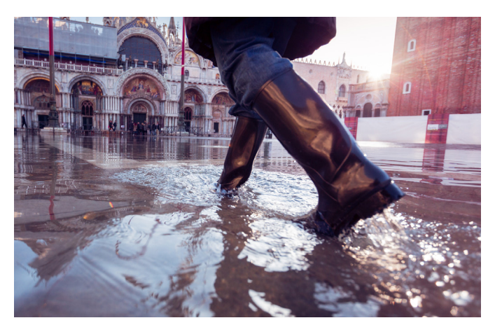
Flooding in Venice

Larger and more frequent large-scale climate events are likely to cause insurance premiums within the hotel industry, among others, to increase. As such, while insurance premiums within certain region currently remain marginally affected, as they are typically based on historical performance, they could rise in regions that are more at risk.