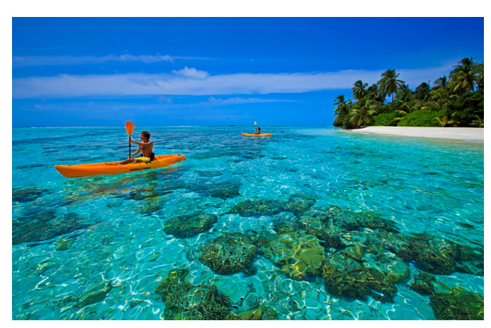
Rising sea levels in Maldives