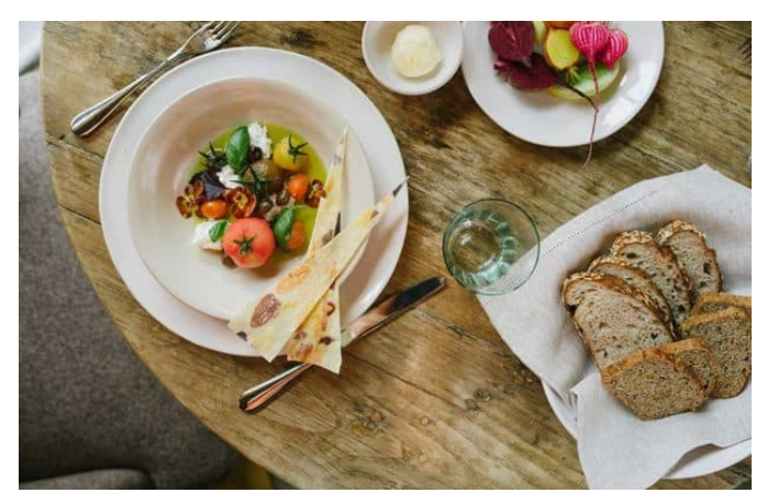
Popular Farm-to-Table restaurants and dining settings

Meanwhile, Hilton has committed to using only brown paper bags to deliver food and other supplies within the guest rooms. The move is likely to generate less plastic waste while increasing cost effectiveness in the long term.