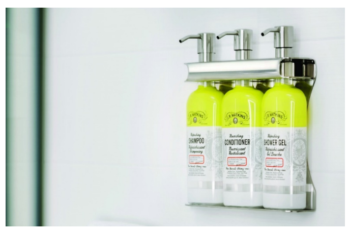
Holiday Inn and Holiday Inn Express bath amenities rolled out by IHG

Research suggests that within the medium term, assets that were once much sought after might become more affordable with a shorter holding period.